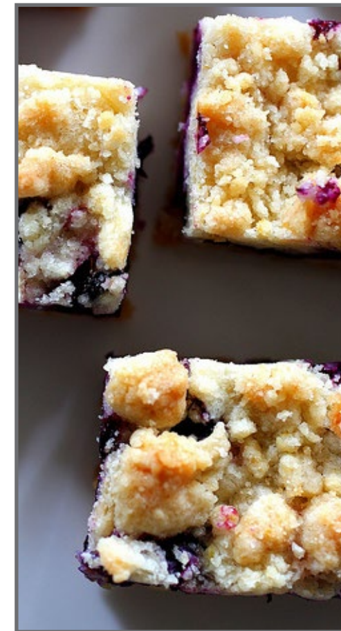
Left: Once the crumb bars have browned, remove them from the oven and then wait 30 minutes until they are cool to slice. Right: The amount of bars you get will depend on how small they are sliced.