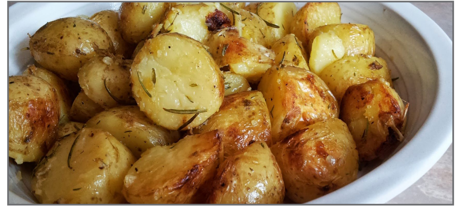
Left: Be sure not to overcook the new potatoes or they will become too mushy. When finished, serve on the side.