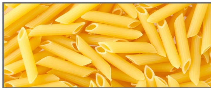
Clockwise From Left: The ziti can be pre-made and baked 30 minutes before you are ready to serve. Serve ziti with Parmesan cheese for some extra flavor. Though penne rigate is suggested, any pasta is suitable for ziti.