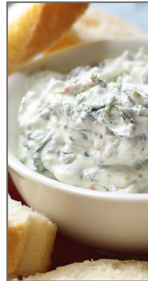
Left: Though the pita chips taste good warm, they can be serve at room temperature and can be saved for several days. Right: The spinach dip can be easily doubled for larger gatherings.