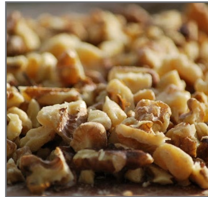
Left: The more you smash the bananas the more incorporated they will be with the banana bread batter. Right: Chop walnuts into small pieces that will easily distribute throughout the bread.