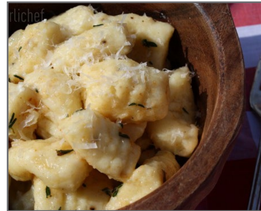
Left: Roll each piece of the dough over a wooden plank with ridges or over a fork to get texture. Right: Add the Pecorino Romano to the gnocchi while it is still warm to slightly melt before serving.