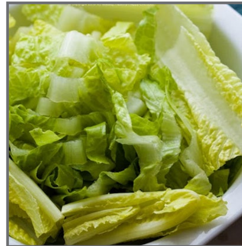
Clockwise From Left: If eating the wrap immediately or on the go, add the dressing to the wrap. Chop tomatoes into small bite-size pieces. Wash and chop lettuce to small pieces.