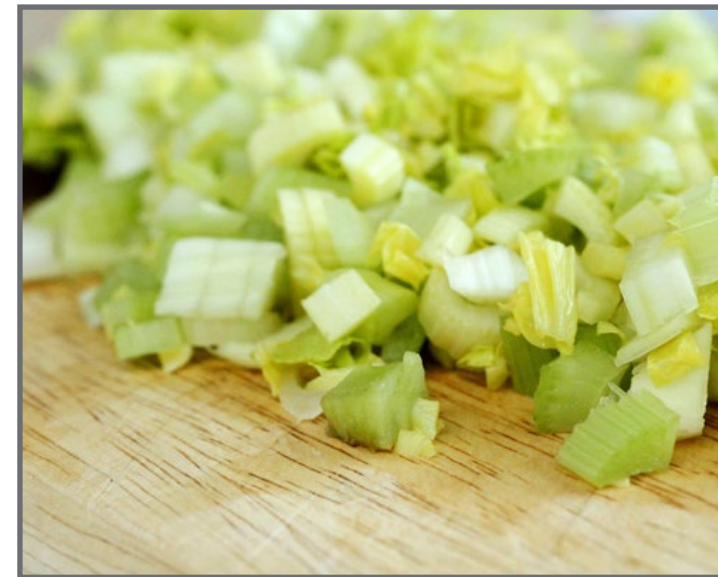
Left: Be sure to wash and seed your bell pepper before chopping. Right: Wash celery stalks and chop into bite-size pieces.