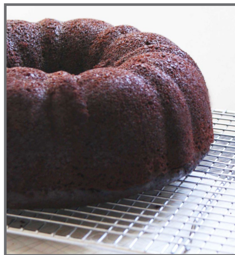
Clockwise From Left: If you make the Death By Chocolate one day before serving, the flavors will have time to meld. Chop the Heath into very fine pieces so it can be evenly layered. Cook your cake up to a day before hand so it is cool enough to layer.