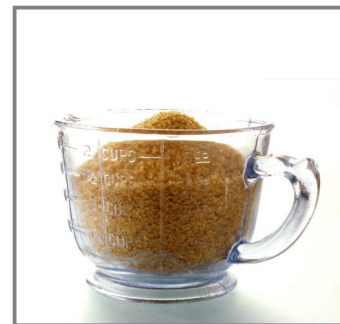
Clockwise From Left: The finished syrup can be stored in a glass jar in the refrigerator for up to two weeks. When measuring the white sugar, be sure there are no lumps. Brown sugar must be packed for a proper measurement.