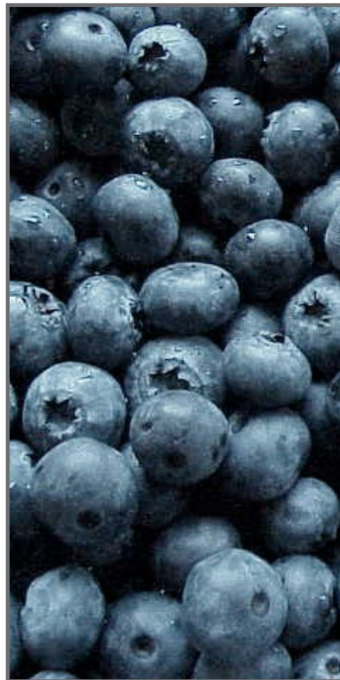
Left: Gently folding the blueberries into your batter will ensure they are not crushed. Right: Frozen blueberries can also be used for the pancakes.